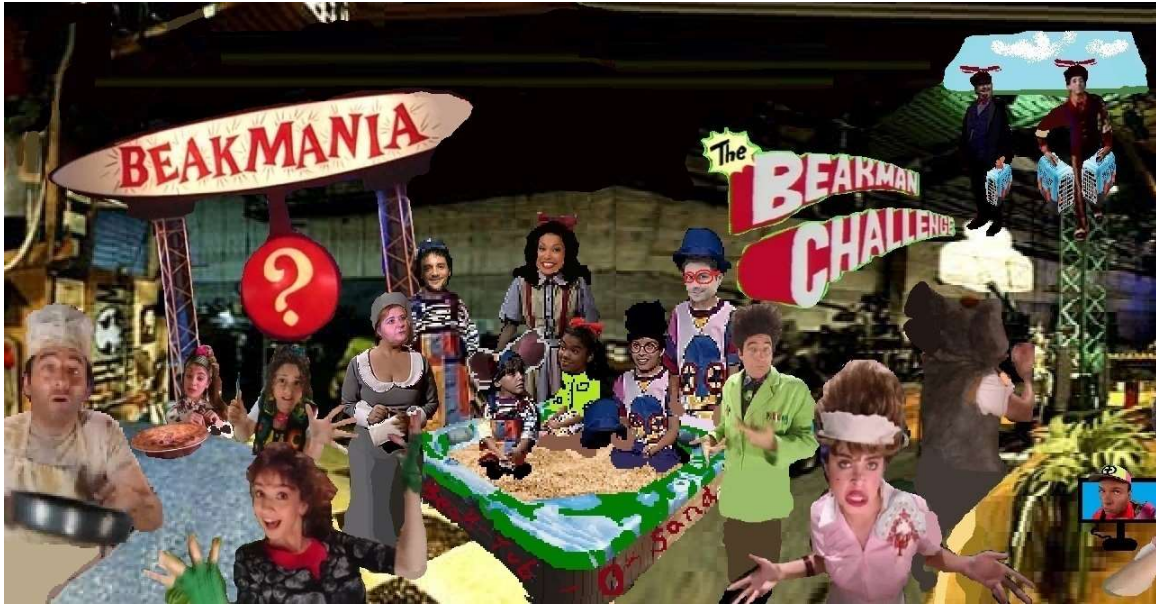
Originally posted in "Beakman Fans" on March 14, 2018.